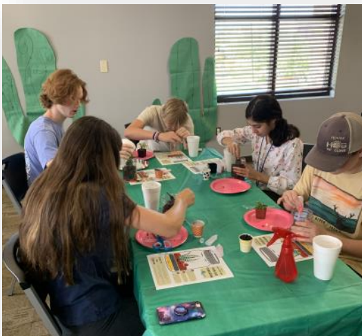
Terrarium-making for teens