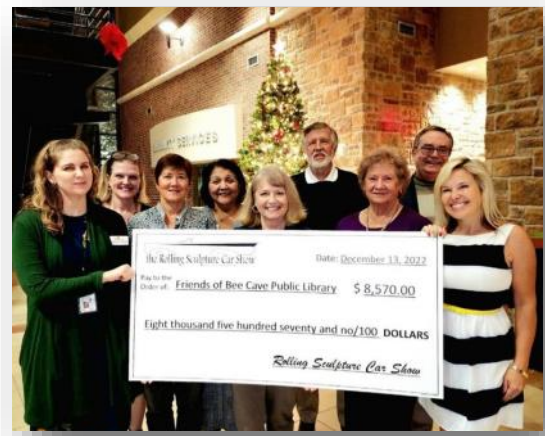
Friends and staff joined RSCS organizers for a "big check" presentation at a City Council meeting.