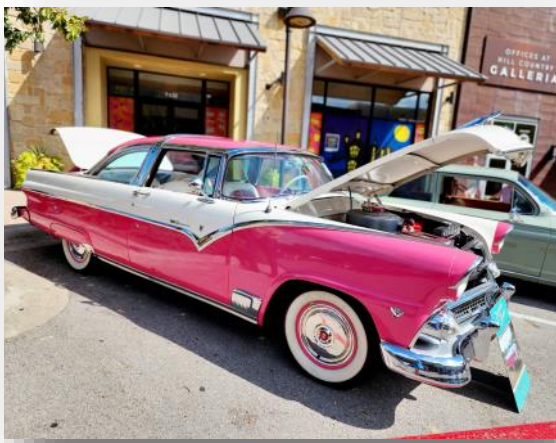
Cars on display at the 2022 Rolling Sculpture Car Show