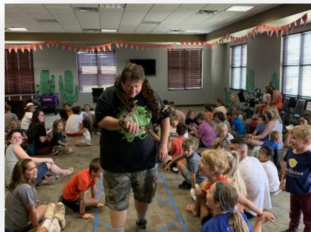
Attendance picked up dramatically by the time of our Summer Reading Program.