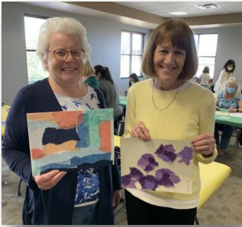
Torn-paper collage-making at What's New Wednesday